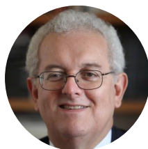
José Antonio Ocampo

Vice-President, Toulouse School of Economics